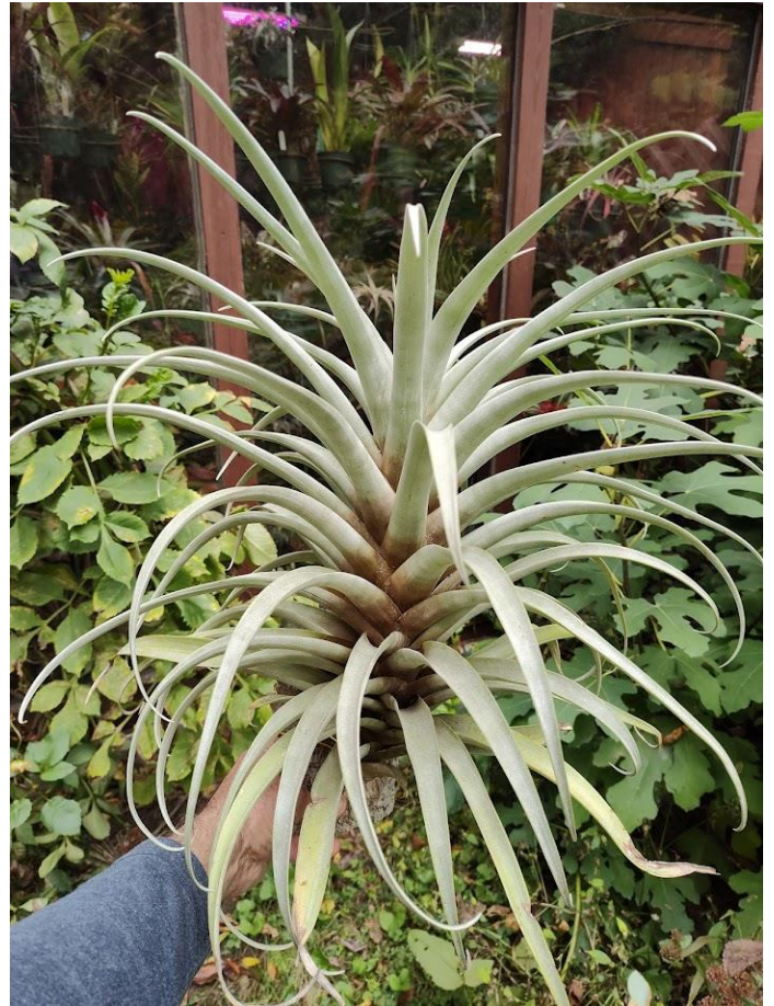
Tillandsia roseoscapa at the author's home. This was acquired during one of the society's Spring plant orders several years ago. It was glued to the cork but has never shown any inclination to produce roots!