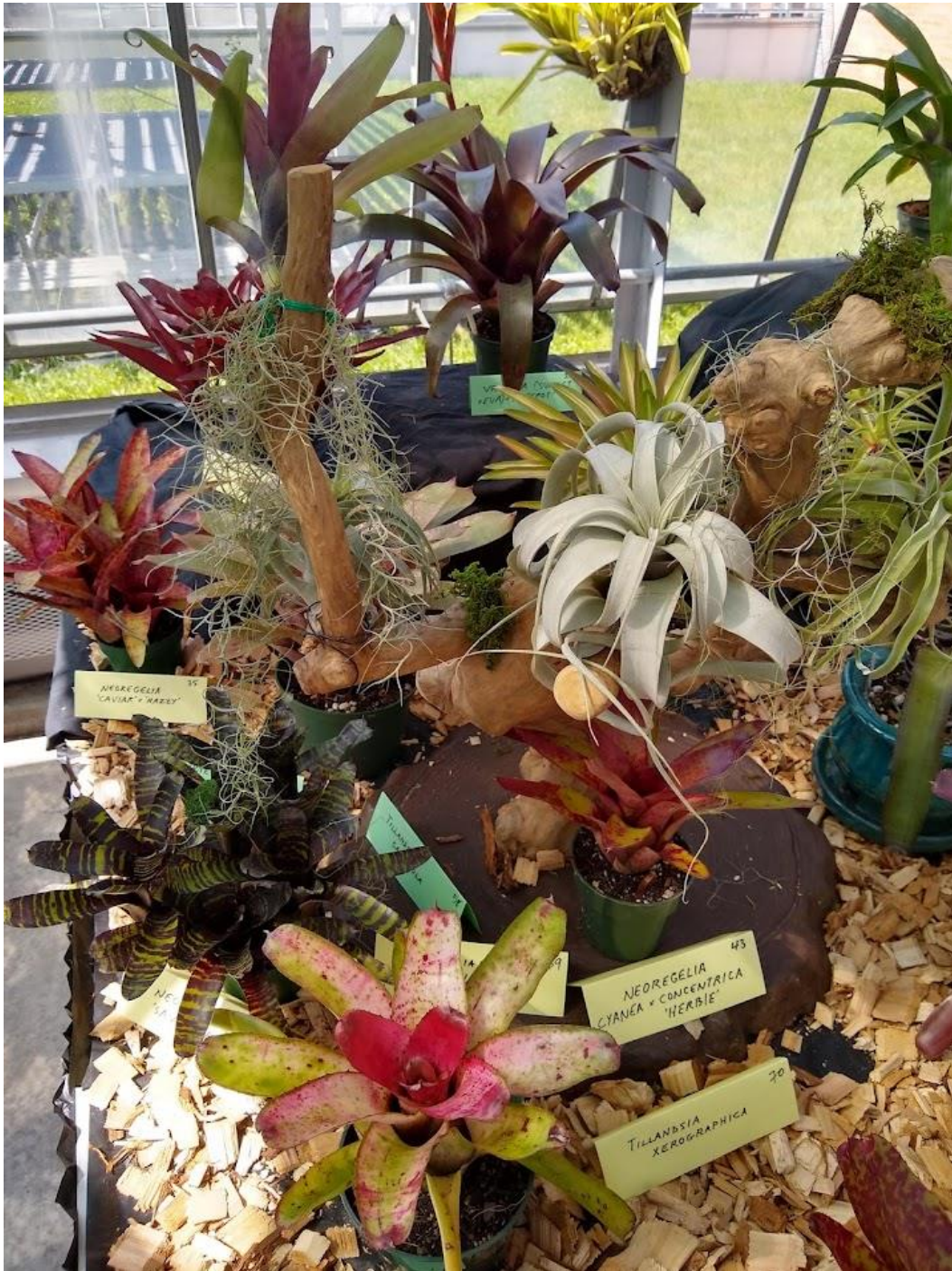
A portion of this year's SEMBS display. The Annual Show and Sale took place on September 9 & 10 at the University of Michigan Matthaei Botanical Gardens.

The Southeast Michigan Bromeliad Society an Affiliate of the Bromeliad Society International November/December 2023