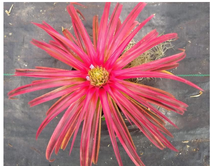
x Sincoregelia 'Galactic Warrior'