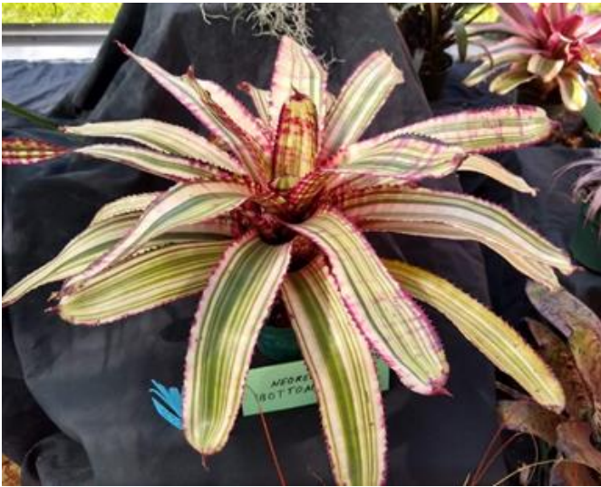
Neoregelia 'Bottoms Up'