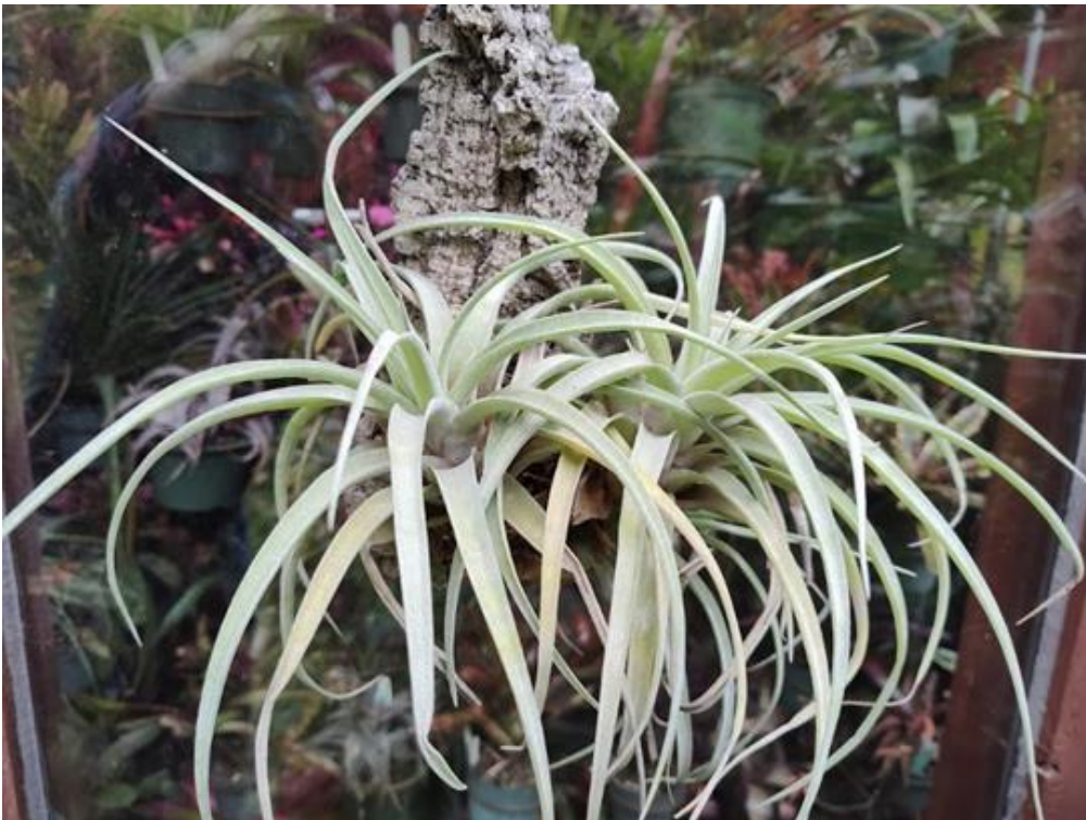
This specimen of Tillandsia concolor x streptophylla has become well established and thoroughly rooted on the cork. In the author's experience, this hybrid has been far less fussy to grow than either of its parents!